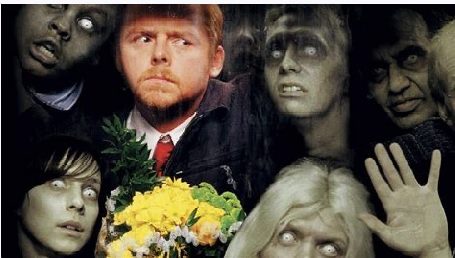
Zombie app download for android. Zombie hack apk download. Zombie catchers app download. Zombie game app download. Zombie app download apk. Plant vs zombie 2 download app. Zombie highway app download. Plant vs zombie app download.